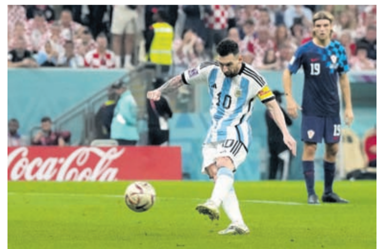
Argentina's Lionel Messi scores the opening goal from the penalty spot during the World Cup semifinal soccer match between Argentina and Croatia at the Lusail Stadium in Lusail, Qatar, Tuesday, Dec. 13, 2022.

Was Argentina's superstar going to have to come off? No such luck for Croatia. □